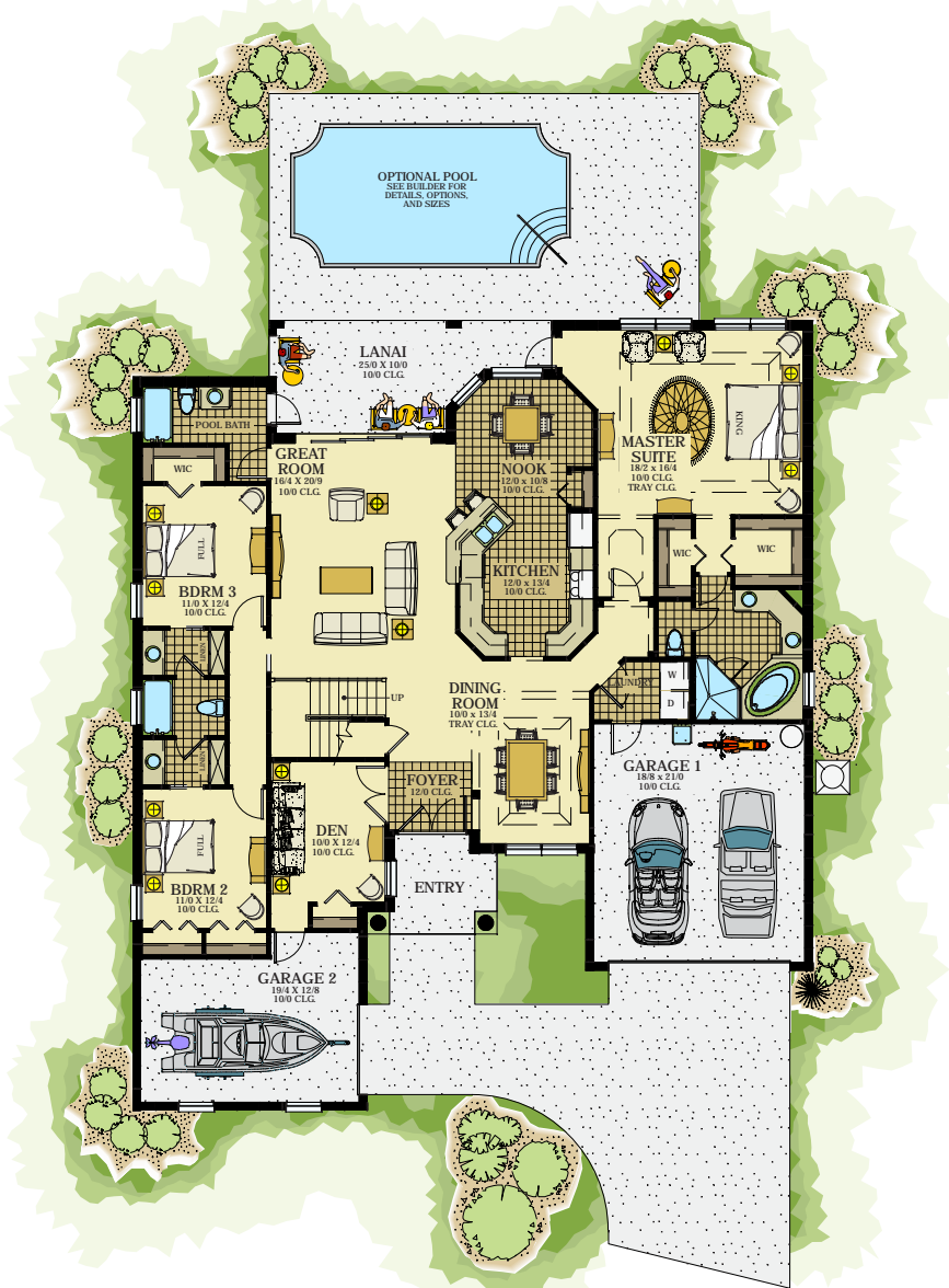
The Karena Main Level

COPYRIGHT 2005 SAMUELSEN BUILDERS, INC. & CLAYTON DESIGN GROUP ALL RIGHTS RESERVED